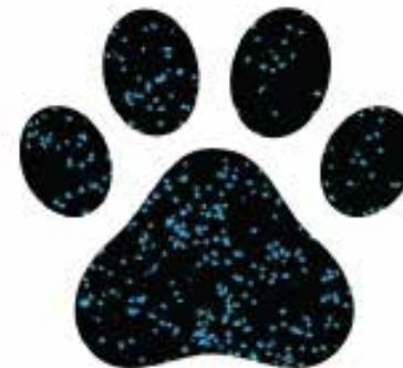
Unprotected Surface After 24 Hours