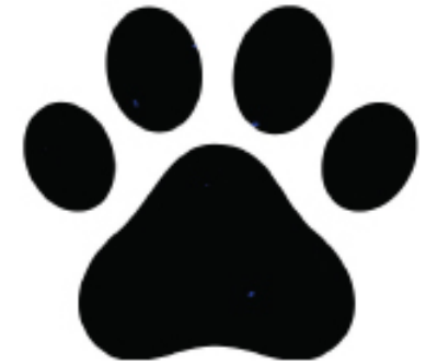
Surface with Microban Protection After 24 Hours

*This information is based upon standard laboratory tests and is provided for comparative purposes to substantiate antimicrobial activity for non-public health applications. Microban technology is not designed to protect users from disease causing microorganisms. Antimicrobial action is limited to product surface and is not intended to protect your pet.